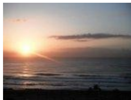
Fantastic view from the hotel