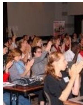
Delegates at WASLI 2011