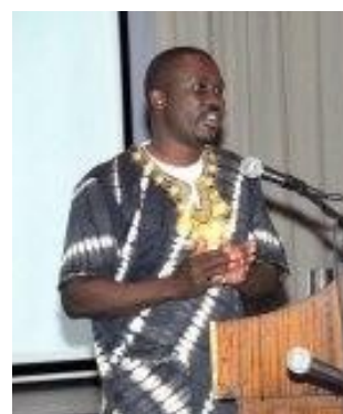
WASLI's new Secretary in action