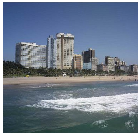
Southern Sun Elangeni Hotel, Durban, South Africa

You will see from the programme page that the first morning (14th) will start at