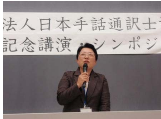
President of JASLI