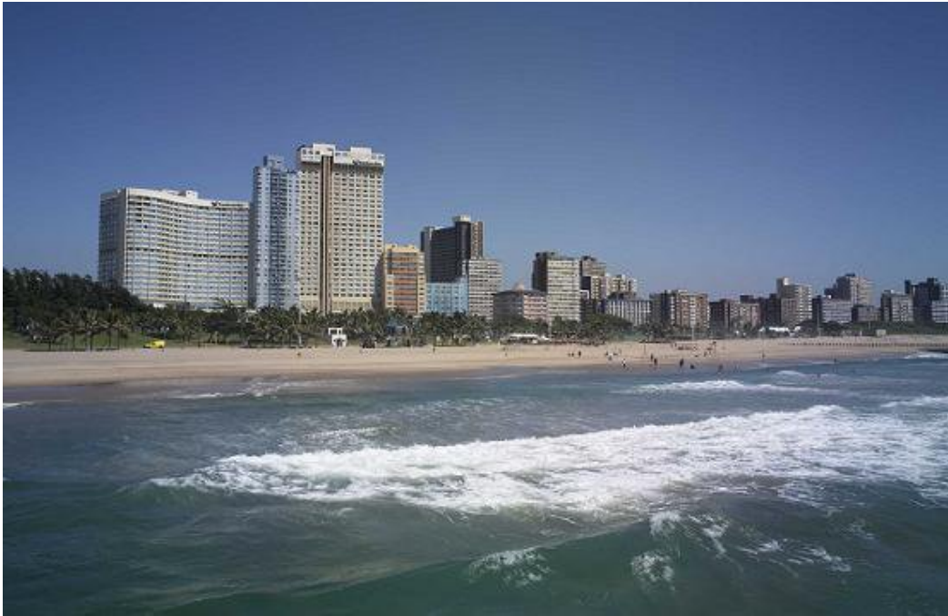
The 2011 WASLI Conference will be on the beachfront in Durban

Keep up to date with information on the website, on WASLI's Facebook page (have you joined yet?) in emails, and future newsletters. Put the date in your diary and plan to be there for a truly memorable experience.